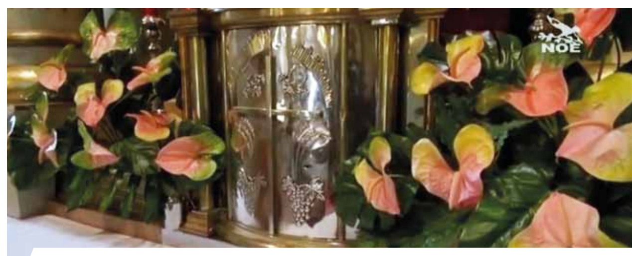
Tabernacle where miraculous Host that fell to the ground was first stored