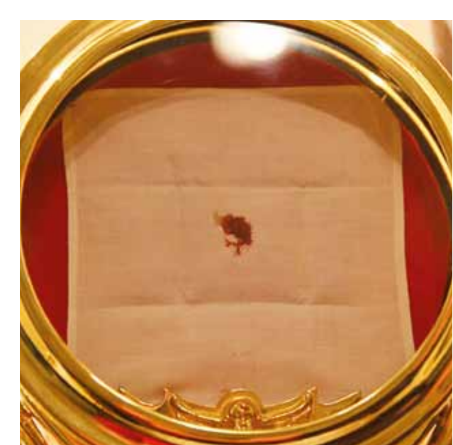
The fragment of the partially dissolved Host with the blood colored substance emanated from its interior is the relic that was placed on the white corporal with an embroidered red cross.