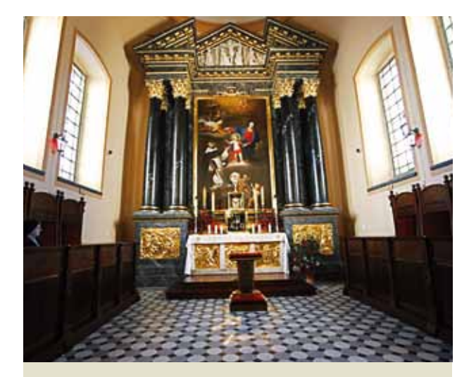
Interior Chapel where the precious Relic is kept