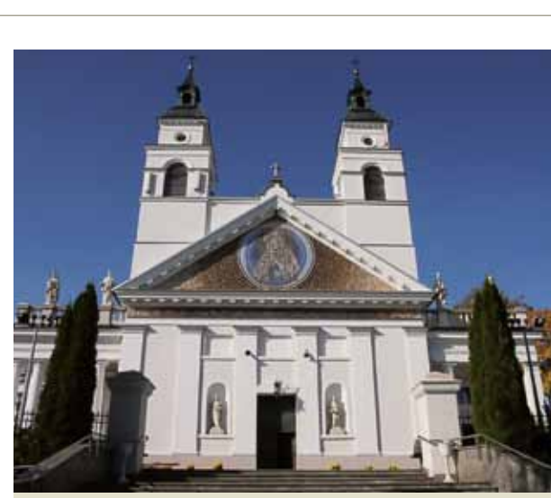
Church dedicated to Saint Anthony in Sokółka